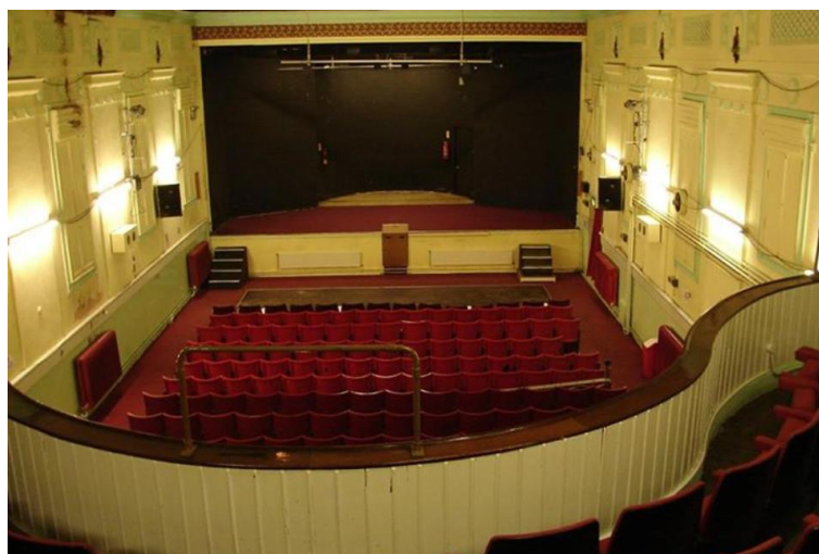
IMAGE 14 – CAERPHILLY WORKMEN'S HALL, SITE OF A PREVIOUS INVESTIGATION WHICH IS DUE FOR PUBLICATION AUTUMN 2016

Once all the footage has been captured, we will then take it to the edit suite and put the film together, ready for online distribution with other films we have made, in order to provide the content over the course of a few weeks/months, this will help to build audience interest and keep people coming back.