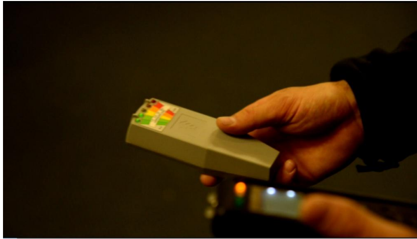
IMAGE 5 – A K2 METRE (WHICH PICKS UP ELECTROMAGNETIC FREQUENCY SHIFTS) AND AN OVILUS (WHICH PROVIDES A MEANS FOR SPIRIT TO SPEAK

The focus of this portion of the evening is to capture evidence from the history of a site or building, or for personal evidence of spirit around those in attendance.