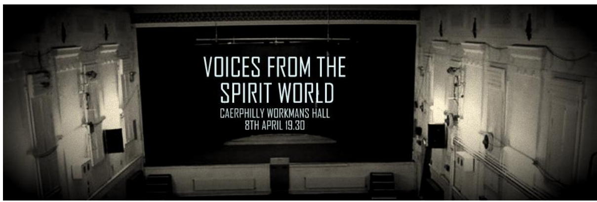
IMAGES 1, 2 AND 3, - POSTERS FROM EVENTS AT DOWLAIS COMMUNITY CENTRE, CWMCLYDACH COMMUNITY CENTRE AND CAERPHILLY WORKMAN'S HALL RESPECTIVELY.